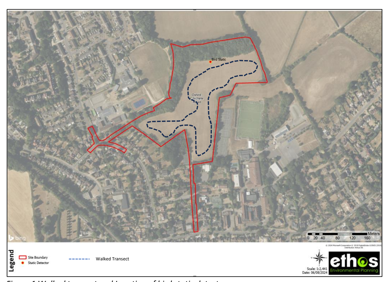
Figure 1 Walked transect and Location of bird static detector

1.1.8 The calls were processed and analysed using the analytical software Quicksight. This software uses automated recognition of bird vocalisations whilst also taking into account the location probability and detection confidence of the record. Any calls below a detection confidence of 0.85 were excluded from the results. For accuracy of call classification, a sub-sample of unusual/rare species records, in context of the site location and habitats present, were manually verified using Audacity software. All calls were checked by experienced ornithologists familiar with bird vocalisations and species distribution, with verification supported call comparisons to Xeno Canto. All false records were excluded from the analysis.