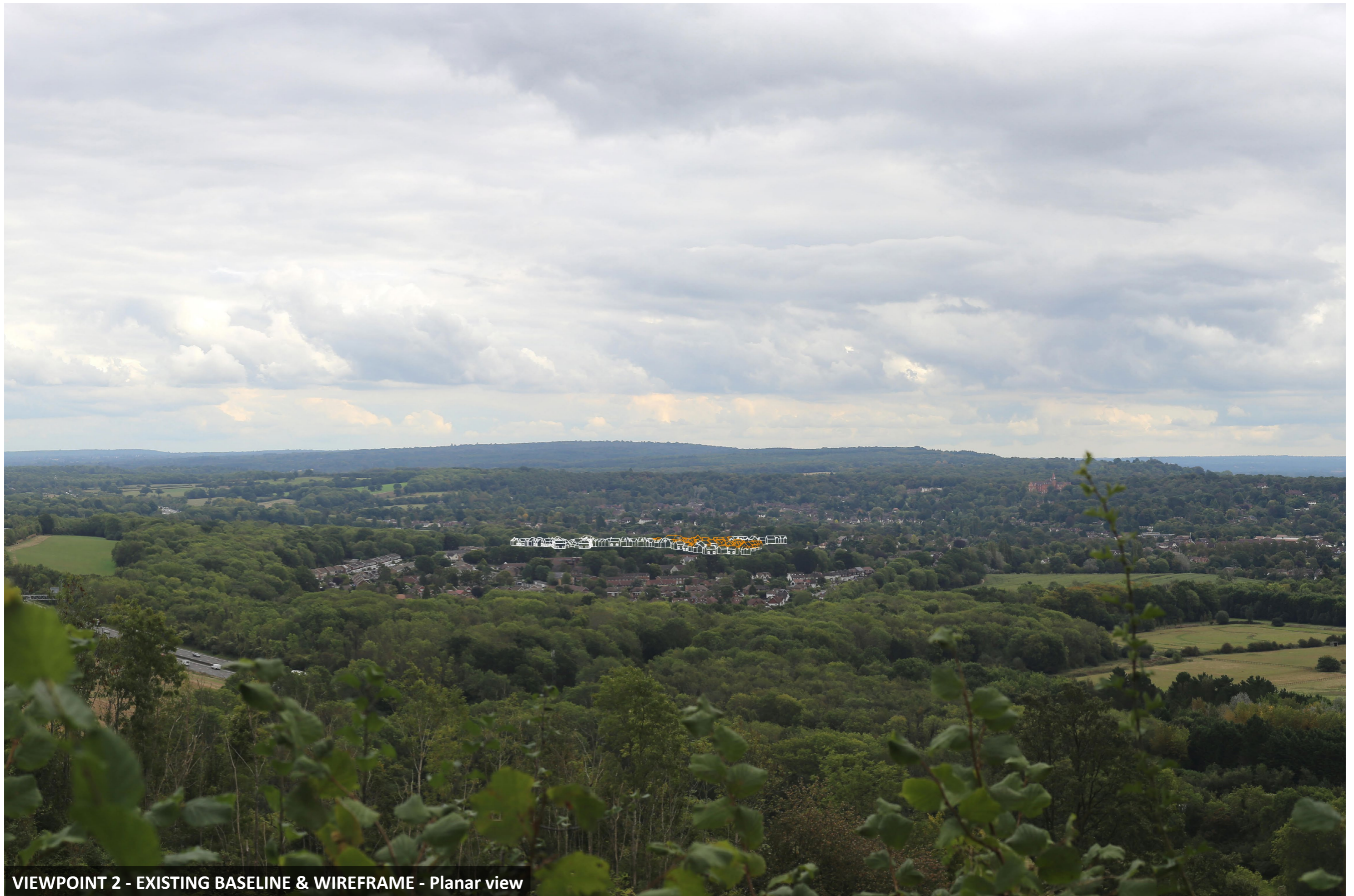
VIEWPOINT 2 - EXISTING BASELINE & WIREFRAME - Planar view