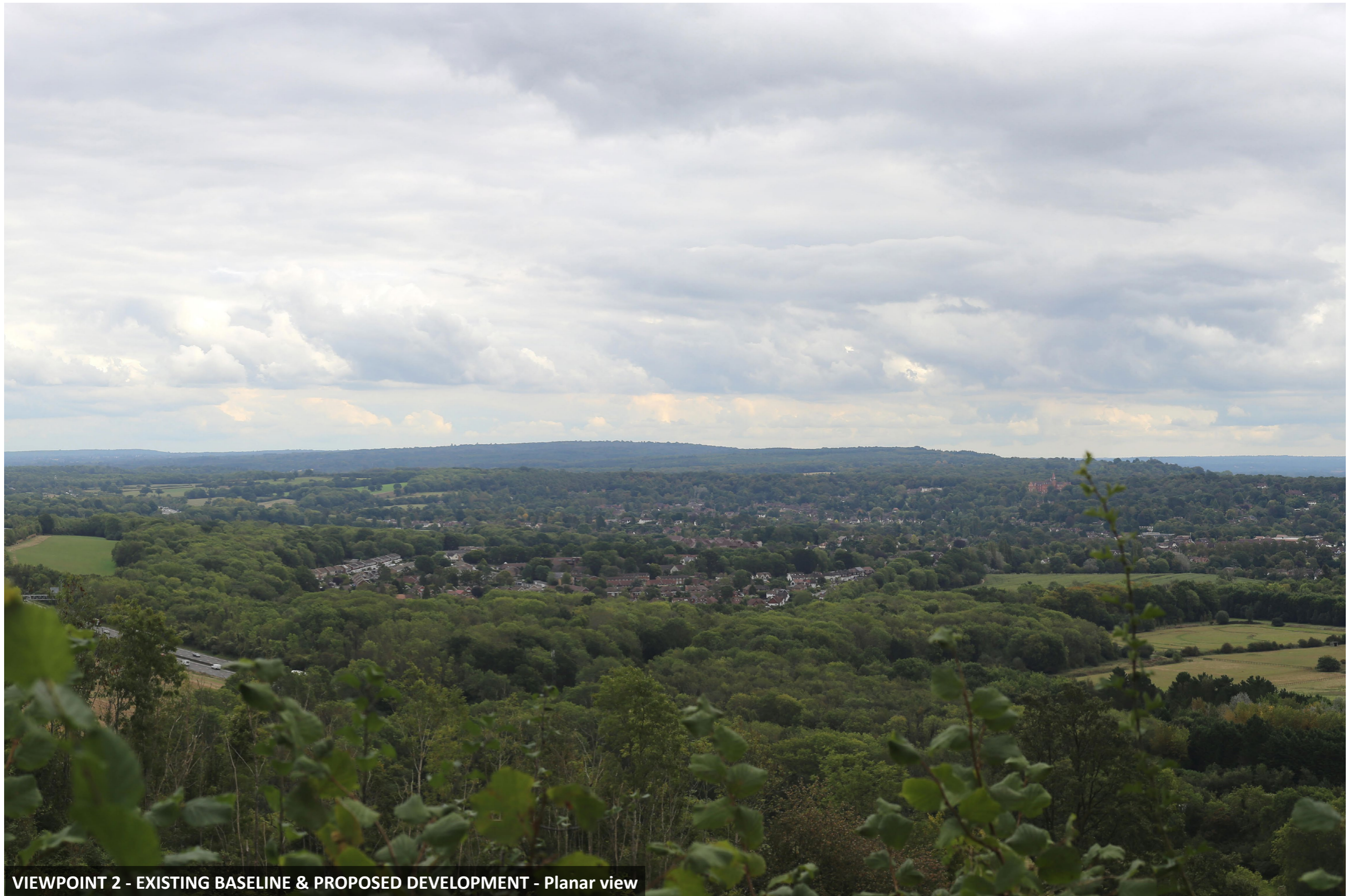
VIEWPOINT 2 - EXISTING BASELINE & PROPOSED DEVELOPMENT - Planar view