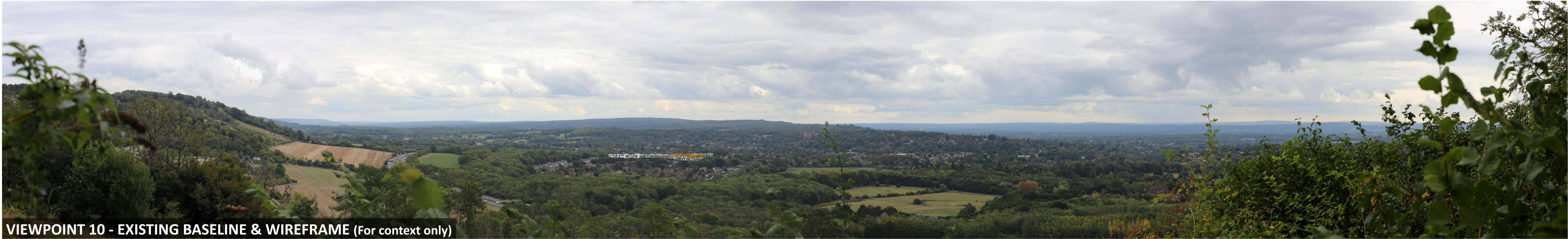
VIEWPOINT 10 - EXISTING BASELINE & WIREFRAME (For context only)