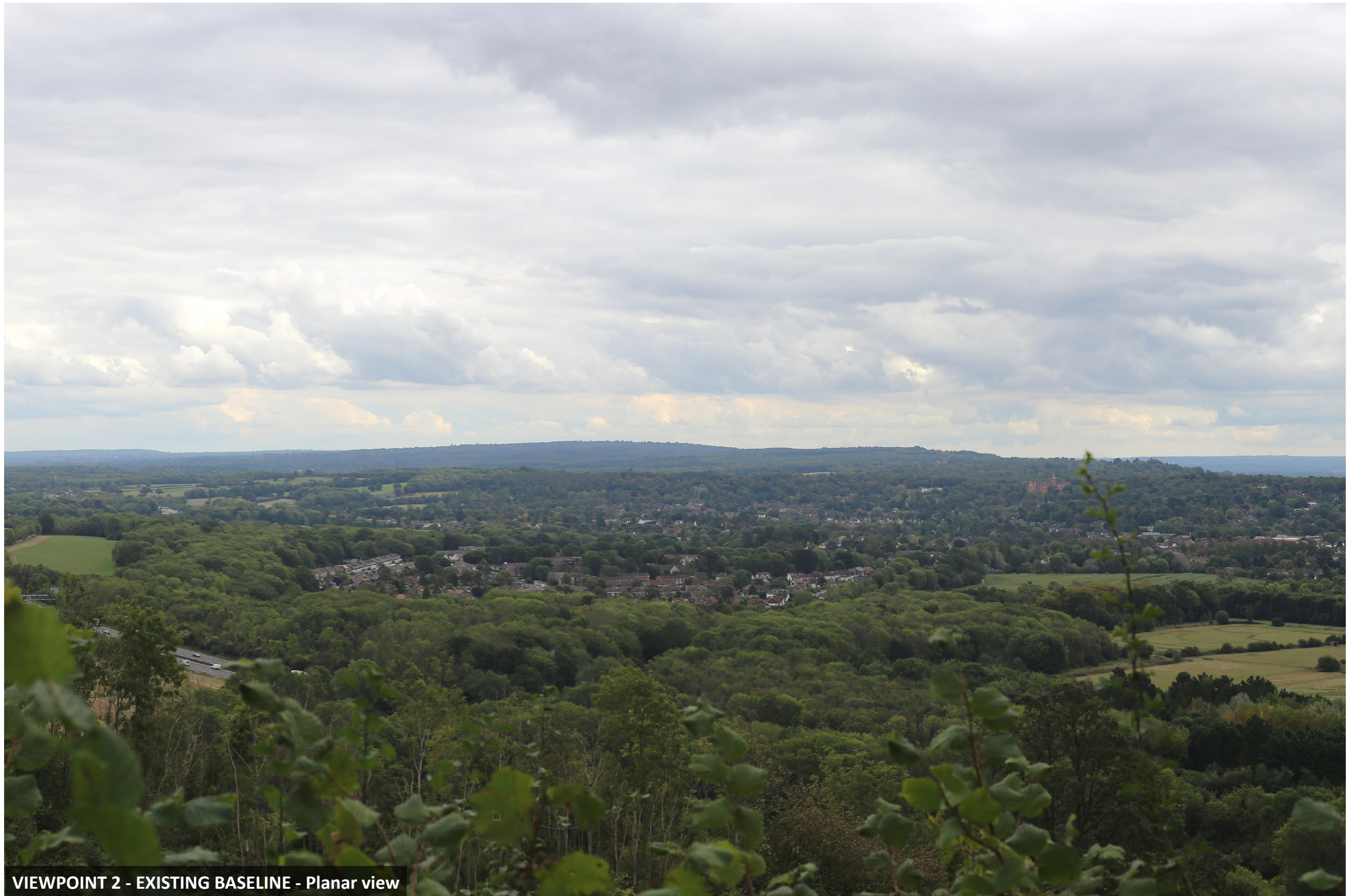
VIEWPOINT 2 - EXISTING BASELINE - Planar view