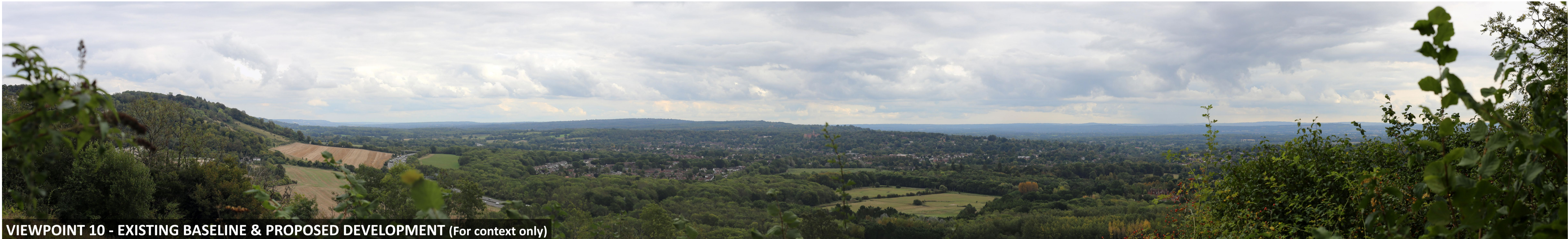
VIEWPOINT 10 - EXISTING BASELINE & PROPOSED DEVELOPMENT (For context only)