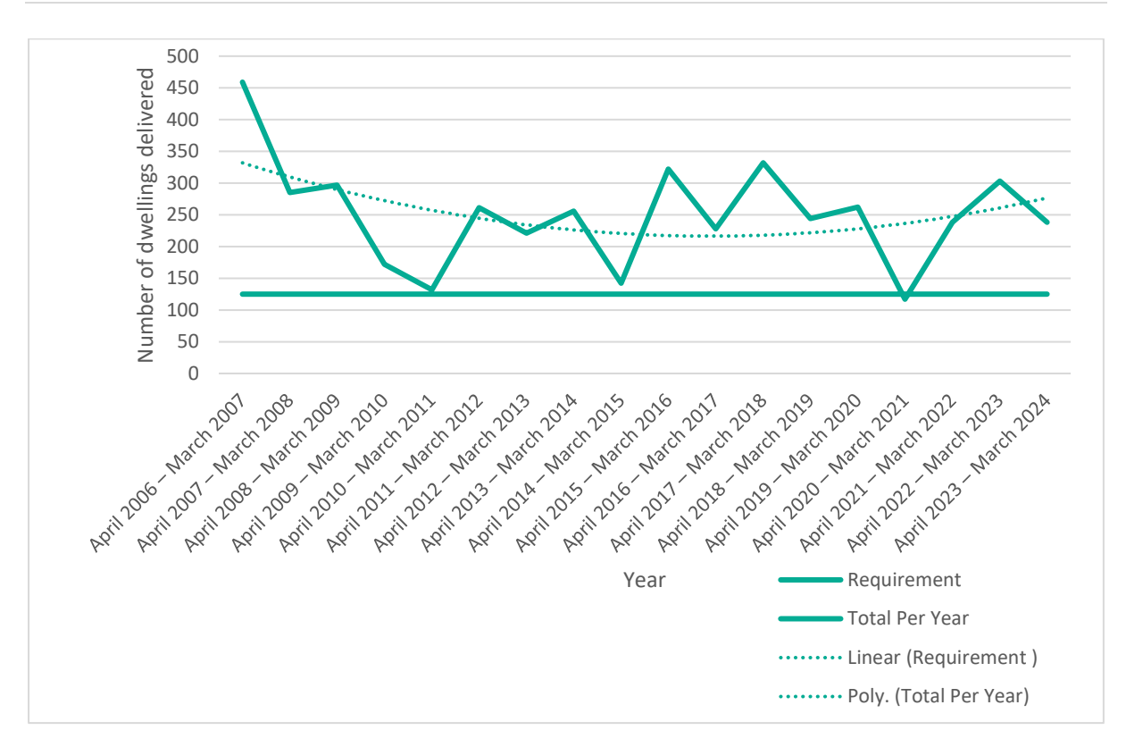
FIGURE 1: NET NUMBER OF DWELLINGS COMPLETED