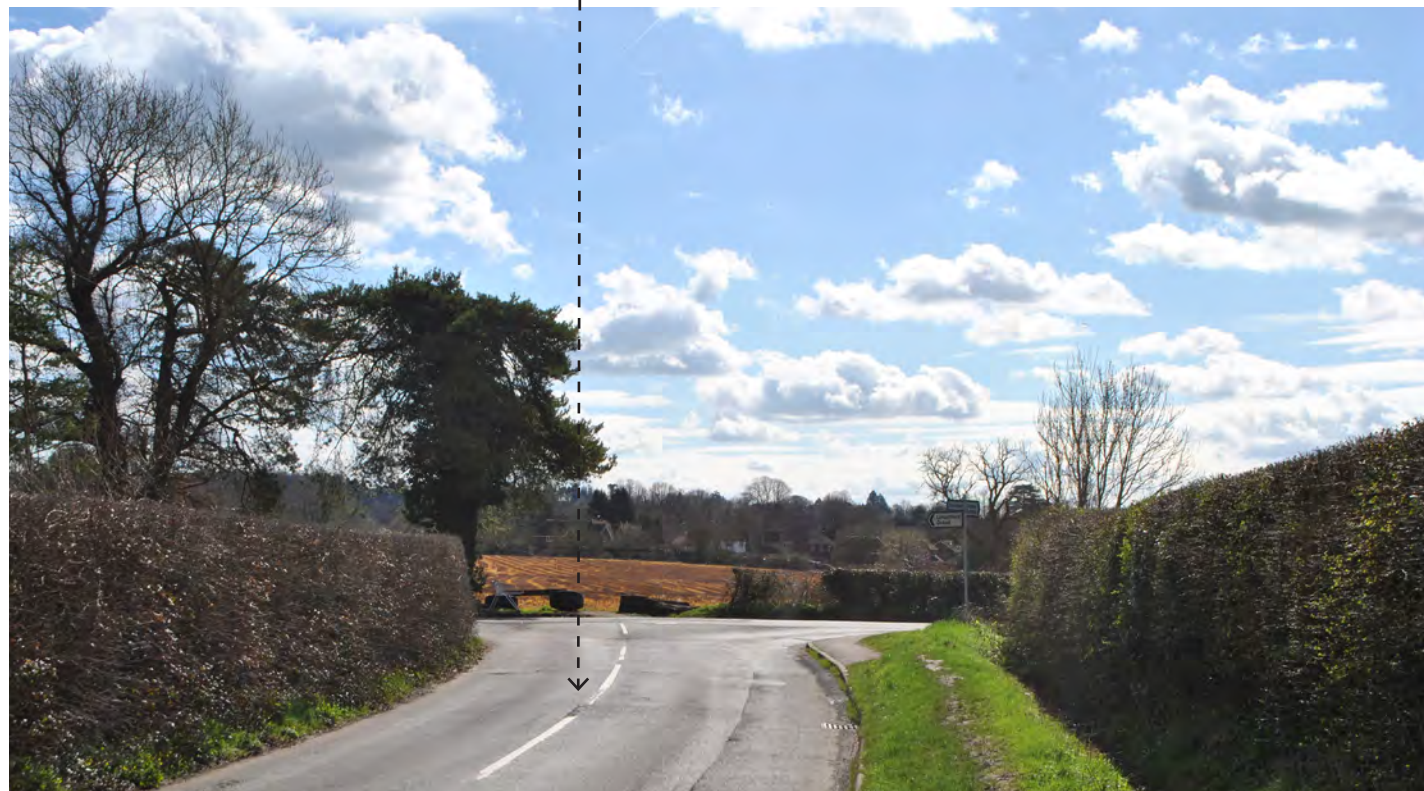
View 13: From Chalkpit Lane, there are open views looking south of the Site

Approximate extent of Site Chalkpit Lane