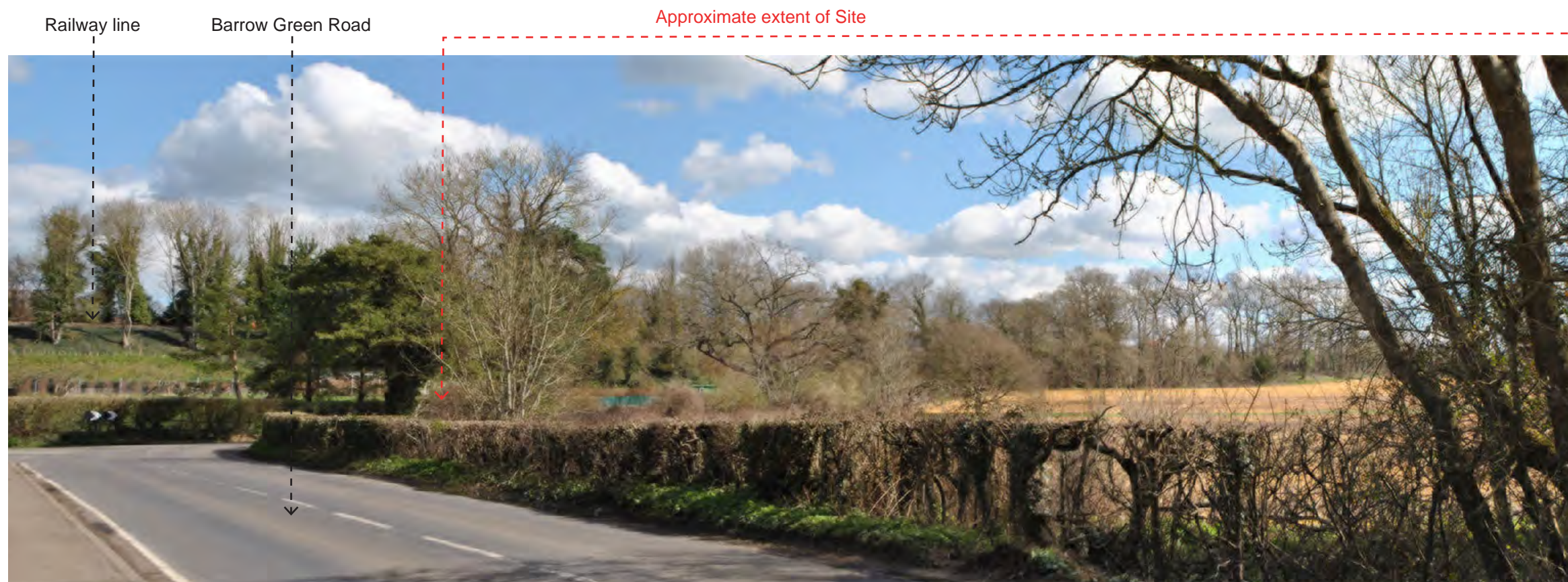
View 11: From Barrow Green Road, there are views of the Site above the hedgerow