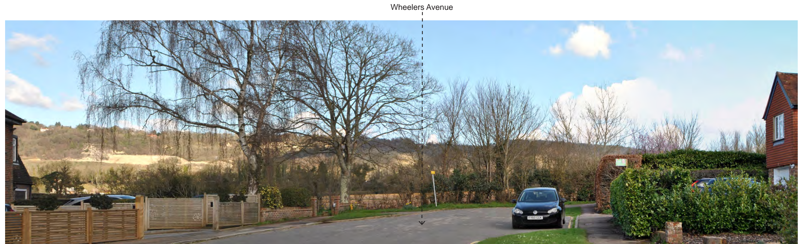
View 14: There are glimpsed views of the Site from Wheelers Avenue, with the scarp rising beyond