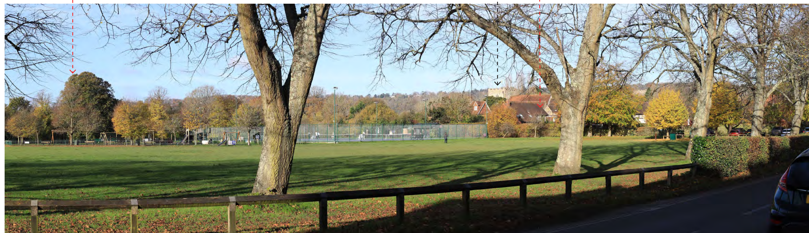
View 16: Looking across Master Park from Church Lane, views of the Site are screened by intervening vegetation