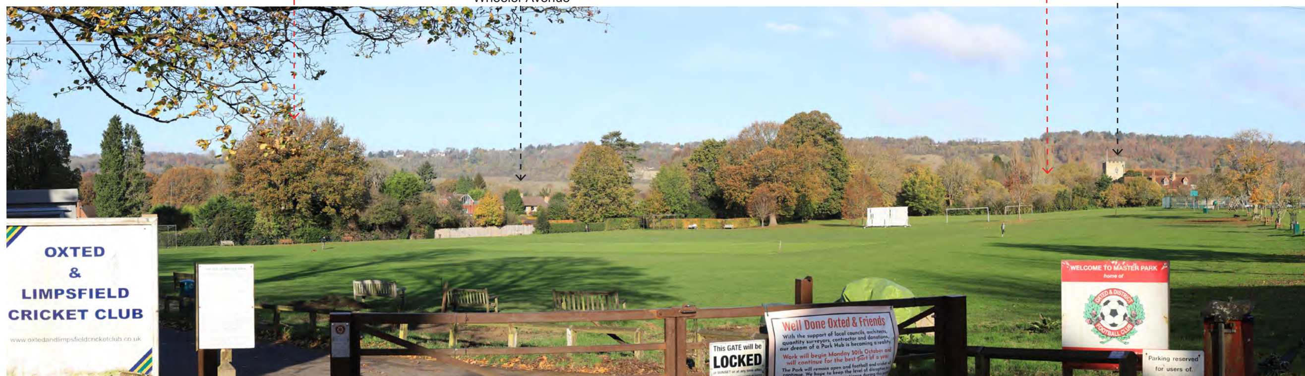
View 15: From the southern extent of Master Park, there are glimpses of the scarp rising in the middle distance, however views of the Site are screened by intervening vegetation