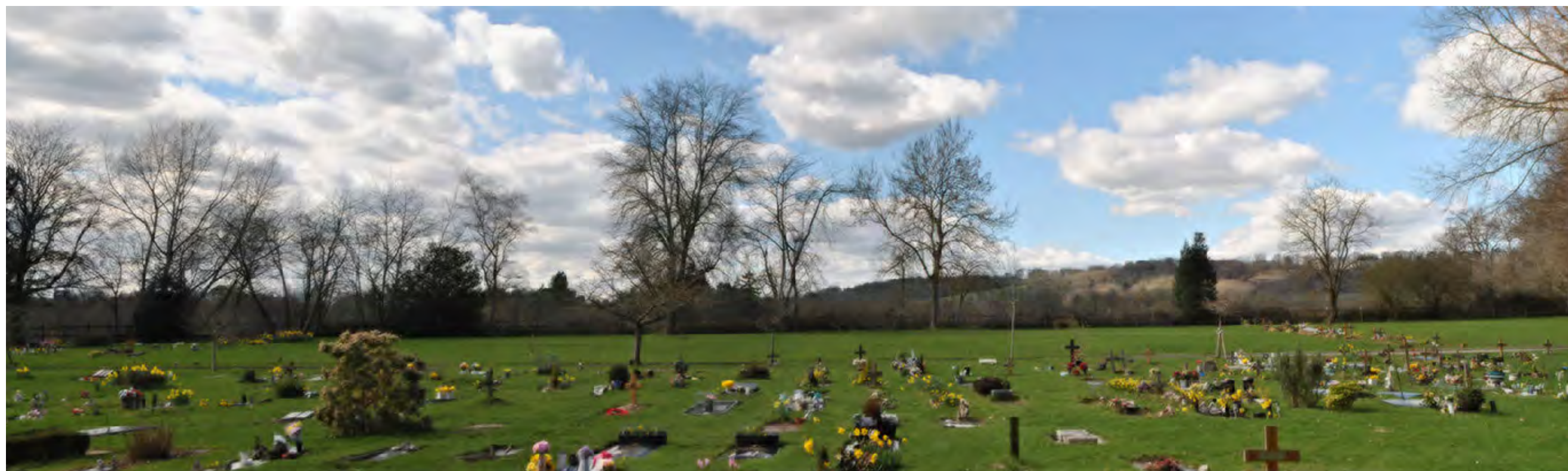
View 7: From the burial ground, there are glimpses of the Site beyond the boundary vegetation with the scarp beyond