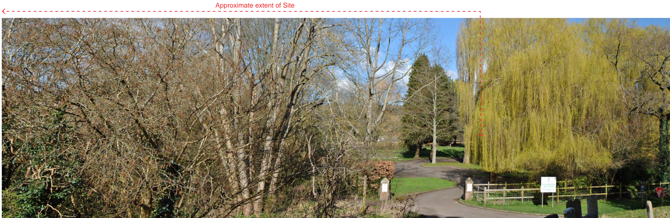
View 8: From the burial ground, there are glimpses of the Site beyond the boundary vegetation