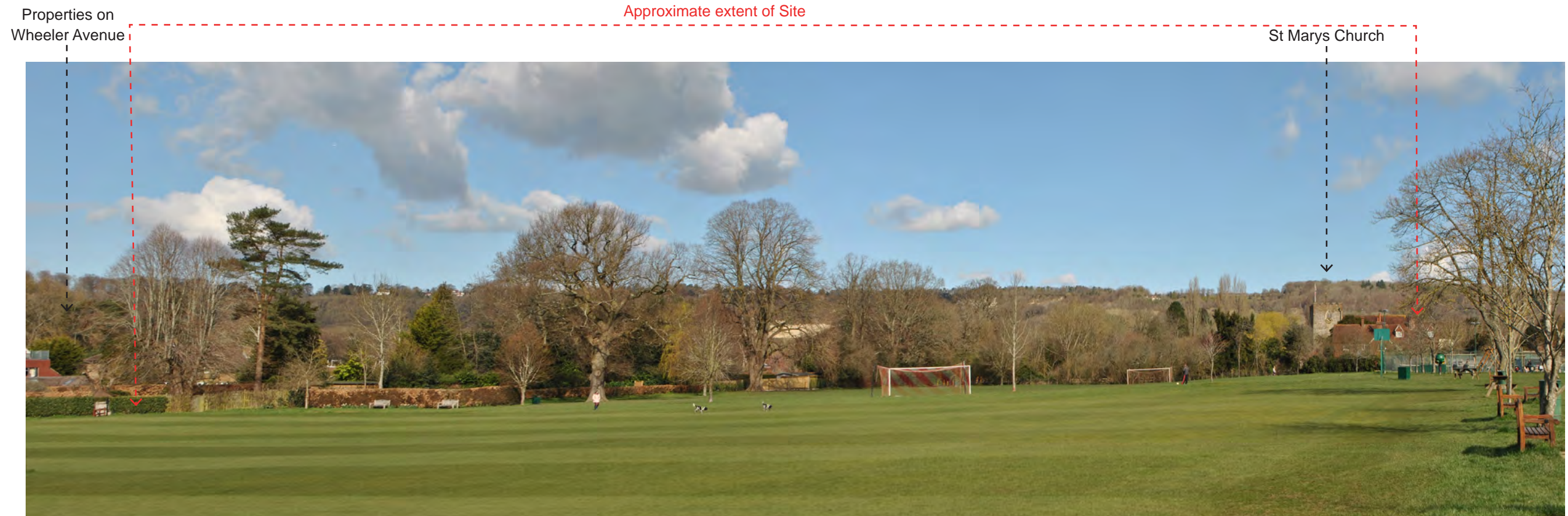
View 9: From Master Park, there are glimpses of the scarp rising in the distance, however views of the Site are screened by intervening vegetation