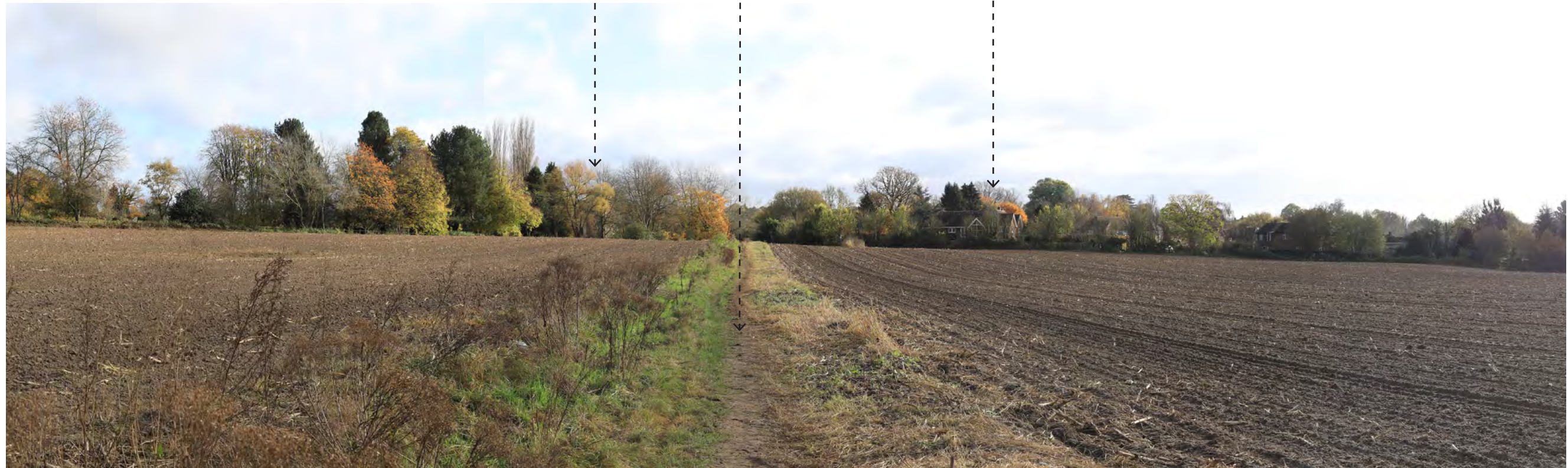
View 3: In views looking south across the Site from PROW UK011/97/10, there are glimpses of built form within Oxted on Wheeler Avenue and occasional glimpses of the church tower beyond the trees