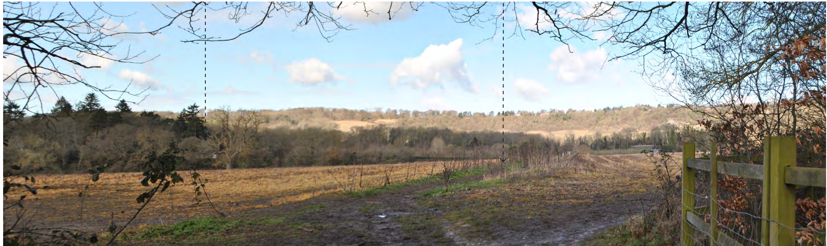
View 1: From the southern stretch of PROW UK011/97/10, there are views looking north across the Site towards the scarp