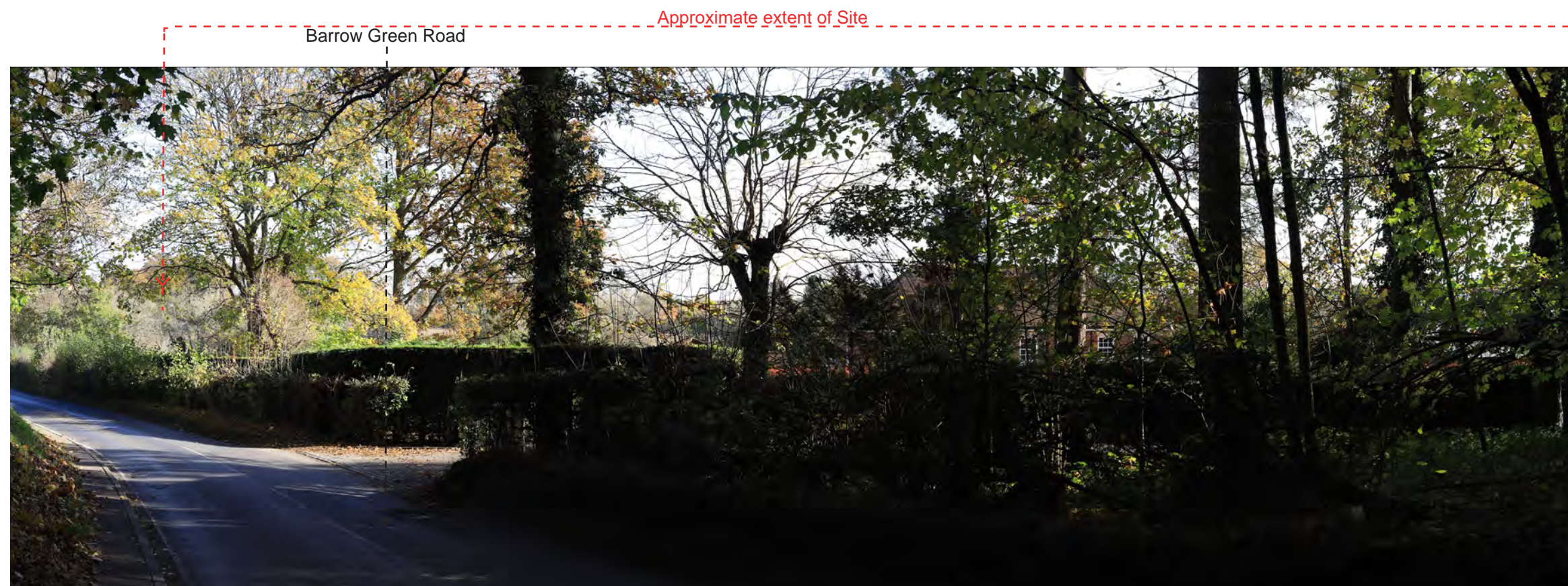
View 12: There are glimpsed views of the Site travelling east on Barrow Green Road