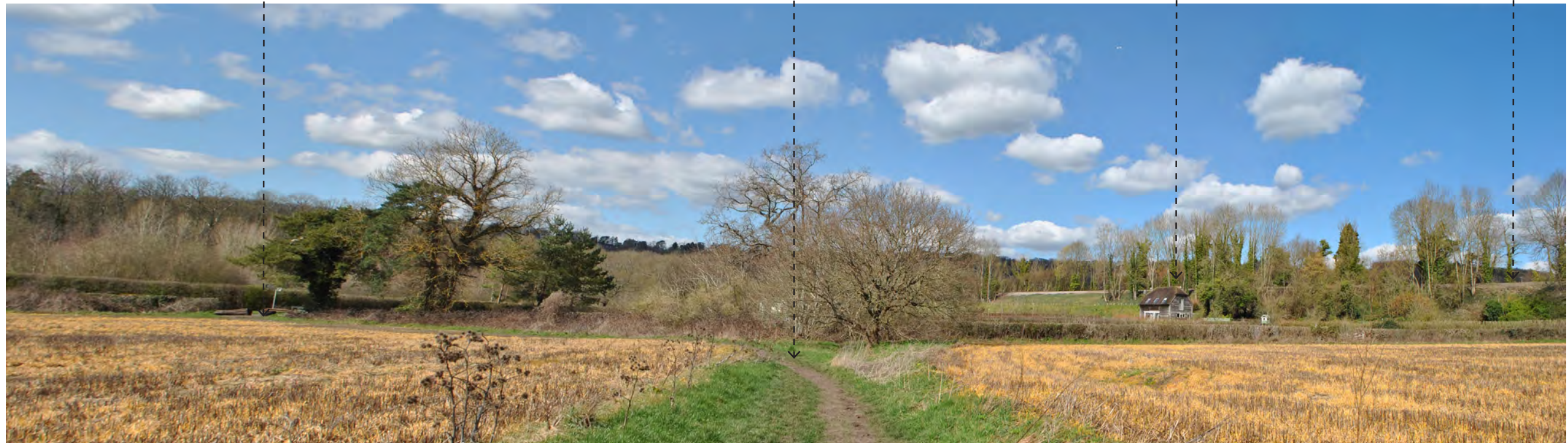
View 2: Looking north from PROW UK011/97/10 as it crosses the Site, there are views towards Barrow Green Road and the scarp