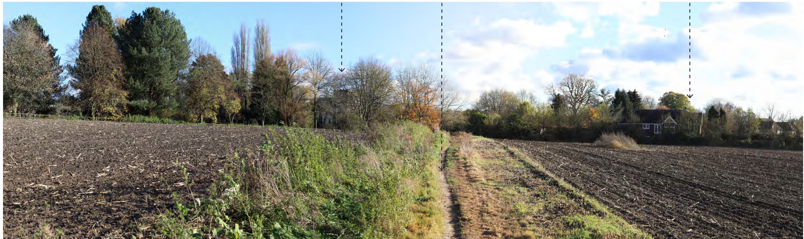
View 4: Looking south moving along PROW UK011/97/10, there are glimpses of built form within Oxted on Wheeler Avenue and occasional glimpses of the church tower beyond the trees