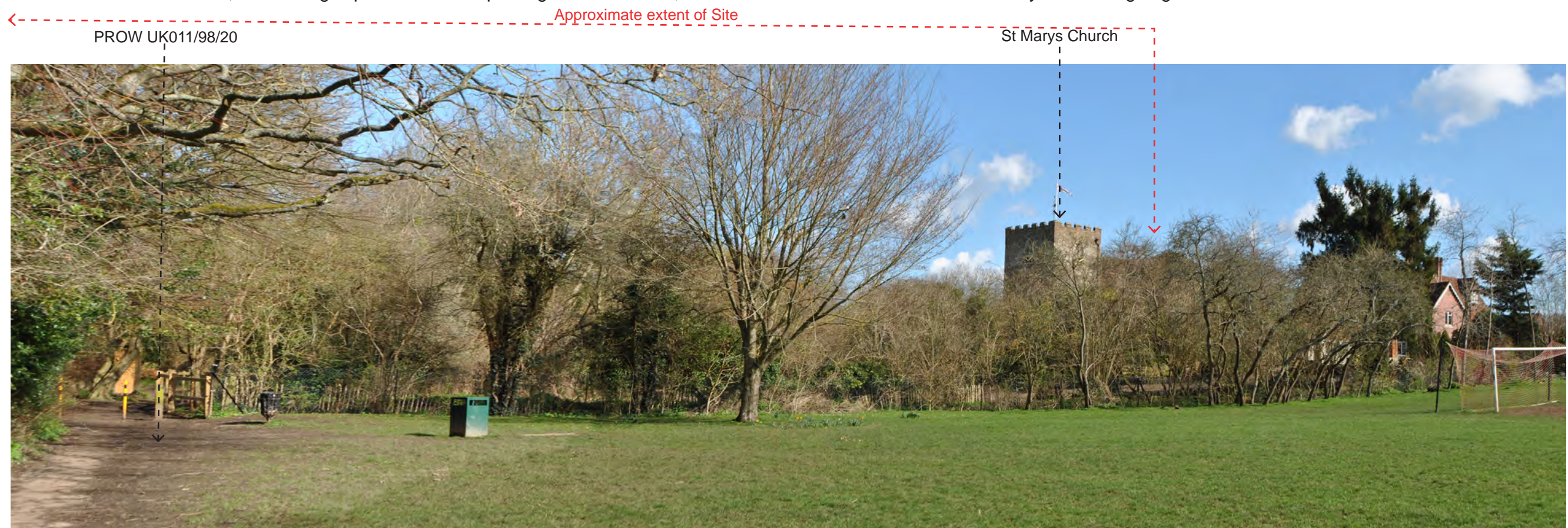
View 10: From PROW UK011/98/20 on the western boundary of Master Park, views of the Site are screened